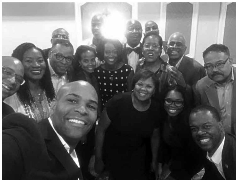
Dr. Jerome Adams, US Surgeon General, in a selfie with attendees at Anesthesiology 2019 in Orlando. Dr. Adams presented the Rovenstine lecture about "The Future of the Physician Anesthesiologist"

Point-counterpoint sessions resulted in great debates focused on critical appraisal of the literature, interpretation of the science, and research in anesthesia. Despite the great discussions and noted advancements in anesthesiology, these sessions often led to the