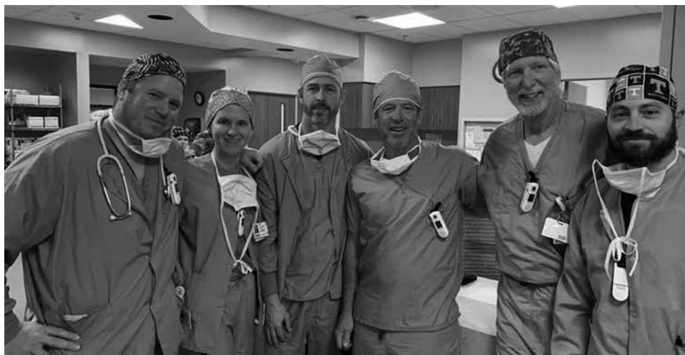
Virginia Highlands Anesthesia

It is never "us" and "them" – even in the